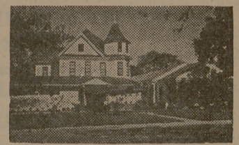
Hillier Funeral Home

GRACE BAPTIST CHURCH 2505 S. College Ave., Bryan An Independent Bible Church 9:15 A.M.—Sunday School 11:00 A.M.—Morning Worship 7:30 P.M.—Evening Worship