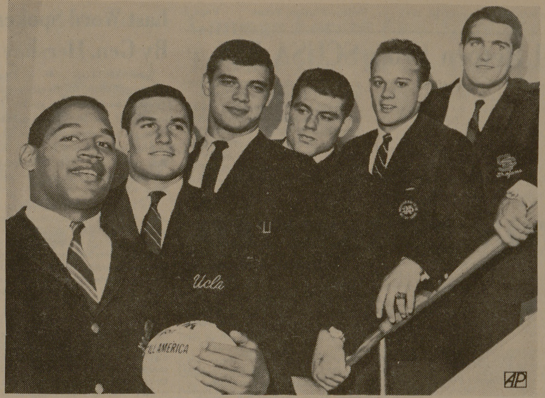
COLLEGE ALL-STARS OF FOOTBALL

This will be the first year for an official champion to be determined. In previous years the tournament has been co-hosted by Houston and Rice University with the teams swapping opponents the second night in a predetermined manner.