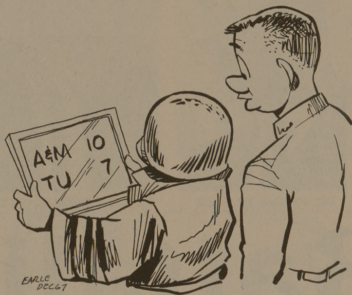
"It's confidential, but I've framed a bunch of these for Christmas presents!"