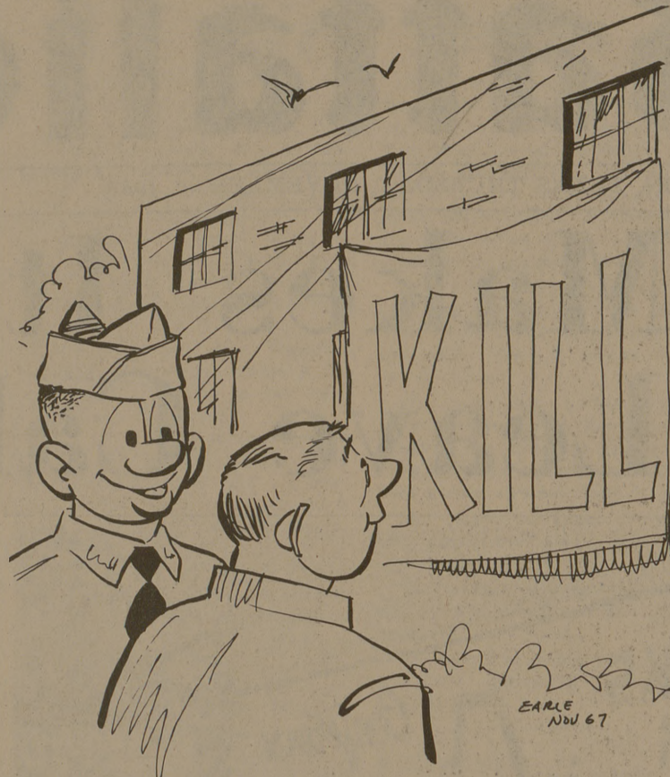
"Our outfit is highly enthusiastic about th' Cotton Bowl game!"