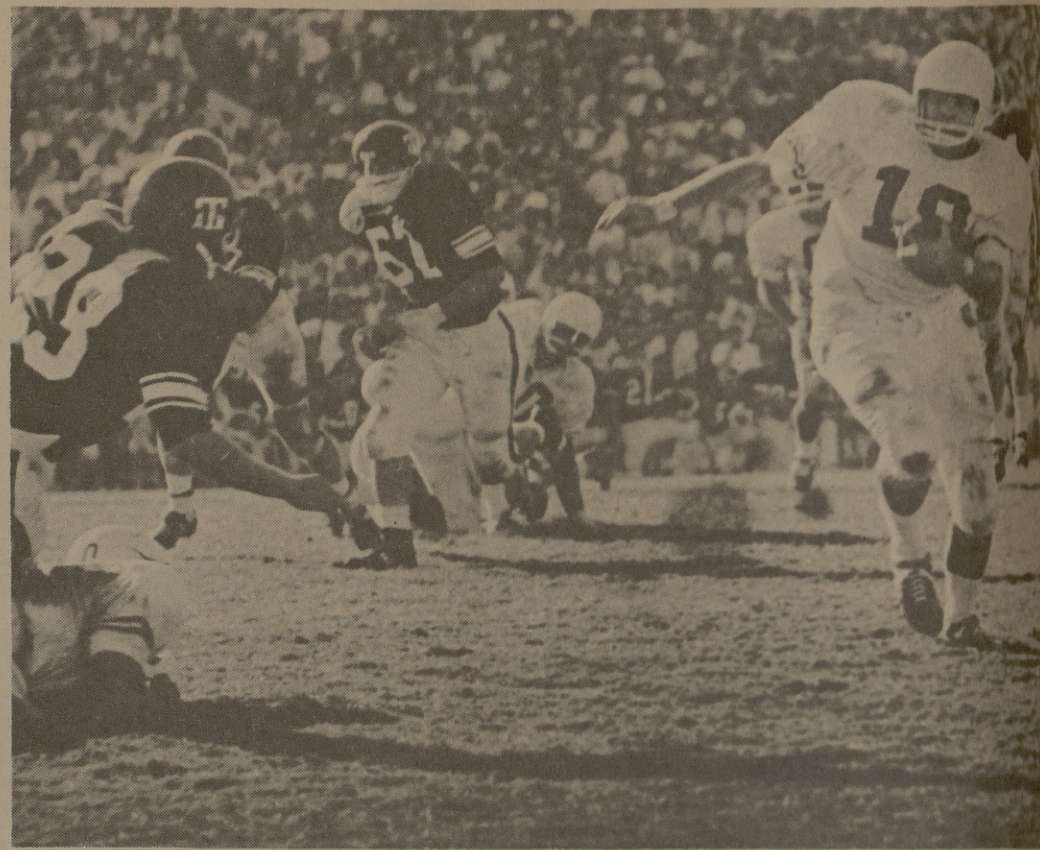
THE END IS NEAR

She would someday like to get a college degree in elementary education.