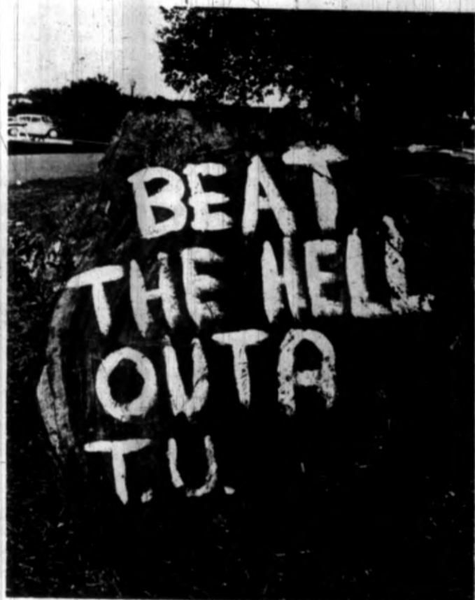
'NUF SAID ...

Chewing tobacco for the first time can really be something. It takes a little getting use to, but so do callouses and they both make you feel good.