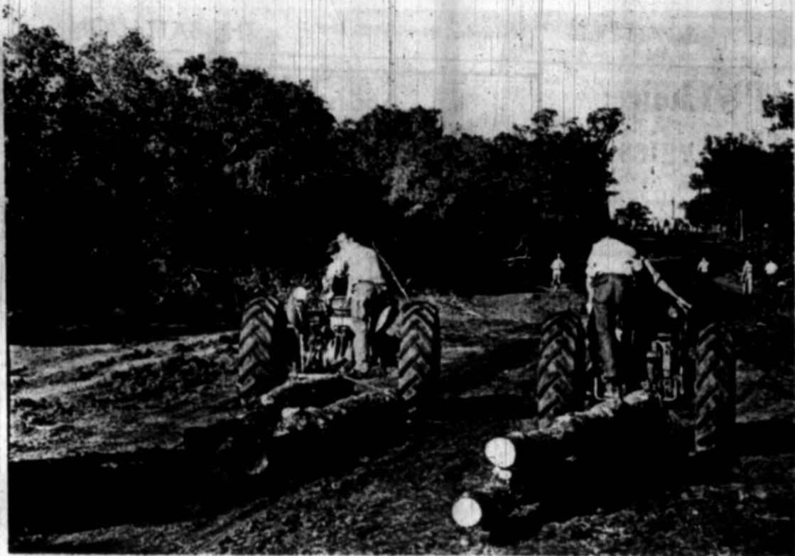
OFF THEY GO

Many upperclassmen might reconsider taking that romantic job offer in the Far North on a logging crew for the summer.