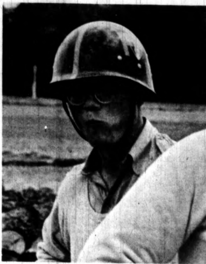
HERE'S MUD IN YOUR EYE

Chewing tobacco for the first time can really be something. It takes a little getting use to, but so do callouses and they both make you feel good.