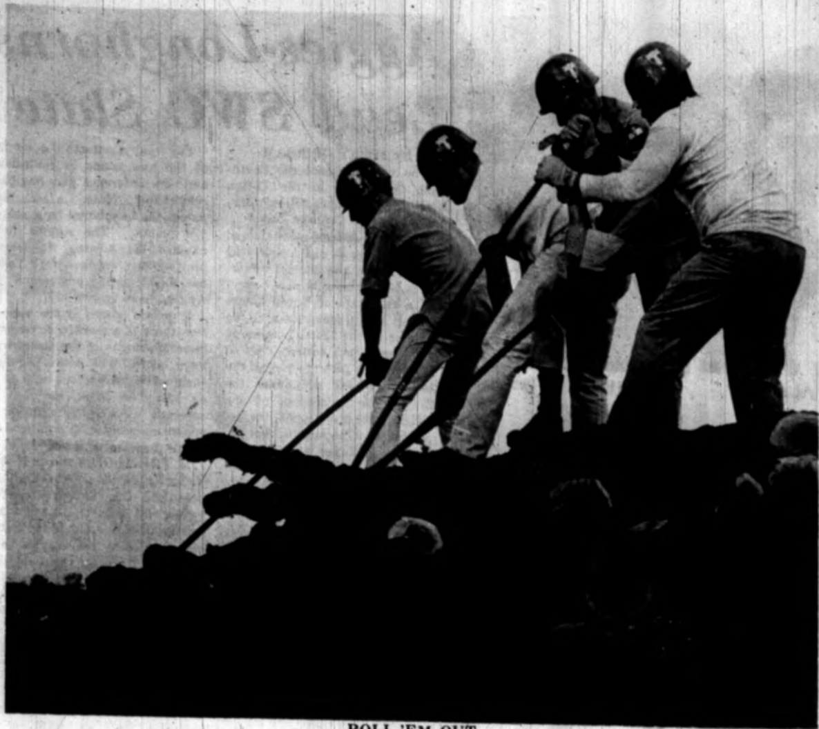
ROLL 'EM OUT

Many upperclassmen might reconsider taking that romantic job offer in the Far North on a logging crew for the summer.