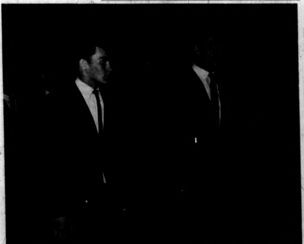
THROUGH THE 'SPIRIT LINE'

Bryan Building & Loan Association, Your Savings Center, since 1919. —Adv.