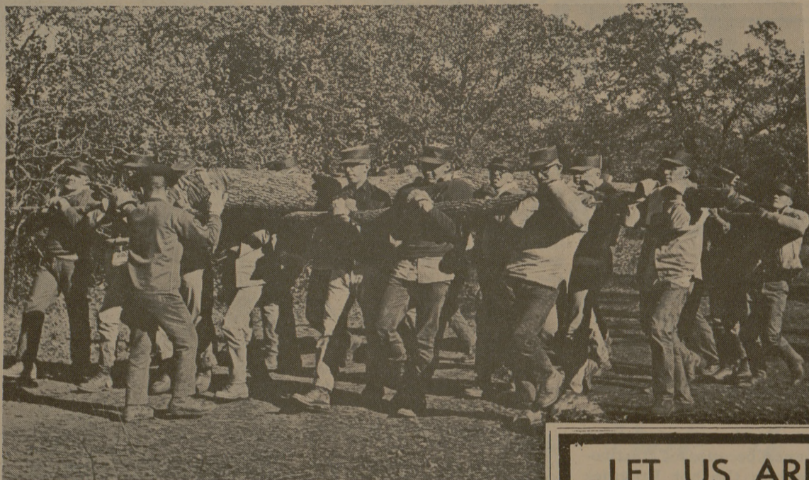
ONE MORE MILE TO GO Fish muscle provides the best method to get the big logs out to the trucks and on their way to the bonfire site.

Even though the sun did come out part of the time to dry up a few of the mudholes, there were always some Aggies able to find just one more wet and muddy spot to cross.