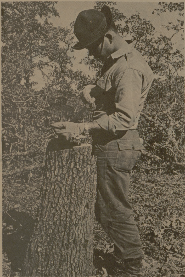
KEEPING IT SHARP

All pictures made at the University Studio — North Gate.