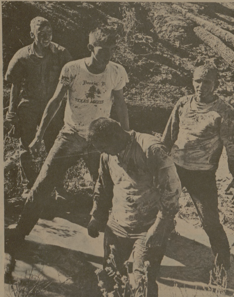
STICK-IN-THE-MUDS Marooned Aggies wait for dry weather so they can escape muddy clutches of the cutting area.