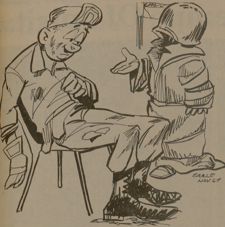
"I know that rank has its privileges but it seems unfair that us freshmen can't work on th' bonfire too during the week."