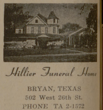
Hillier Funeral Home

BRYAN, TEXAS 502 West 26th St. PHONE TA 2-1572