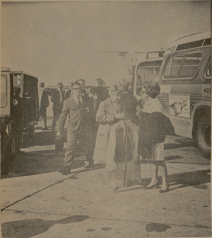
MRS. CONNALLY AT THE AIRPORT Mrs. John Connally greets the Singing Cadets as they arrive in Philadelphia.