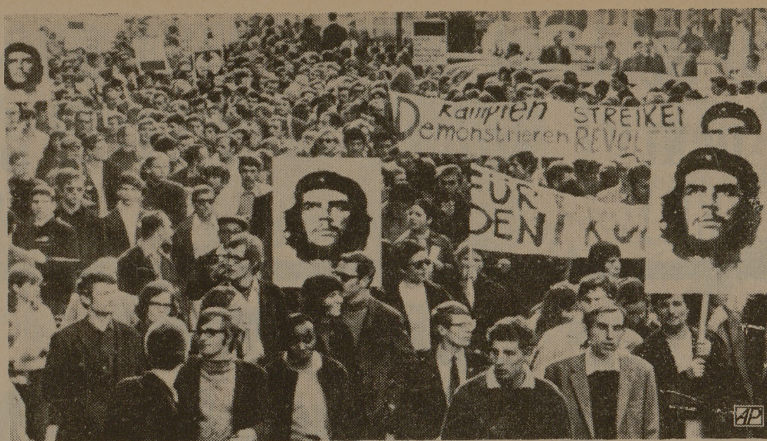
VIETNAM PROTEST WEST BERLIN STYLE Demonstrators carrying large portraits of Ernesto "Che" Guevara, the guerrilla leader reported slain in Bolivia, move down the Kurfuerstendamm during anti-Vietnam war protest in West Berlin. An estimated 9,000 took part in protest.

Meter superintendents, installers and testers are expected to comprise most of the enrollment for instruction in metering, mathematics, trigonometry, vectors, magnetism and other facets of electricity.