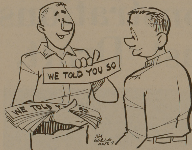
"It's a new bumper sticker to go beside your 'The Aggies Are Back' sticker."