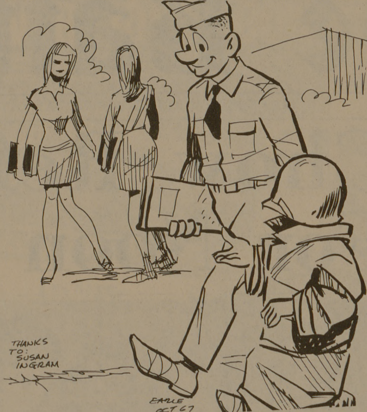
"These are great days for th' short man with hemlines where they are!"