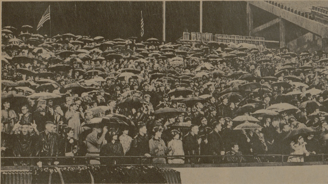
AND THE RAINS CAME

It was a wet, wet, wet Twelfth Man that stood for hours in the rain Saturday night to watch the Florida St. Seminoles edge the Aggies, 19-18.