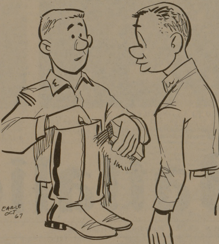
"I don't know what got into her! At the end of th' First Quarter I asked her if I could borrow her raincoat to wrap my boots in and she would hardly speak to me th' rest of the game!"

It should be noted on the Standells' behalf that after they were informed of their mistake at intermission, they complied agreeably to the request that they tone down their act. It should further be noted that an entertainer always gives what the audience wants; and it was evident, from the hoots of laughter from much of the audience, that the fare was fine as far as they were concerned. That says as much about the audience as it does the performers.