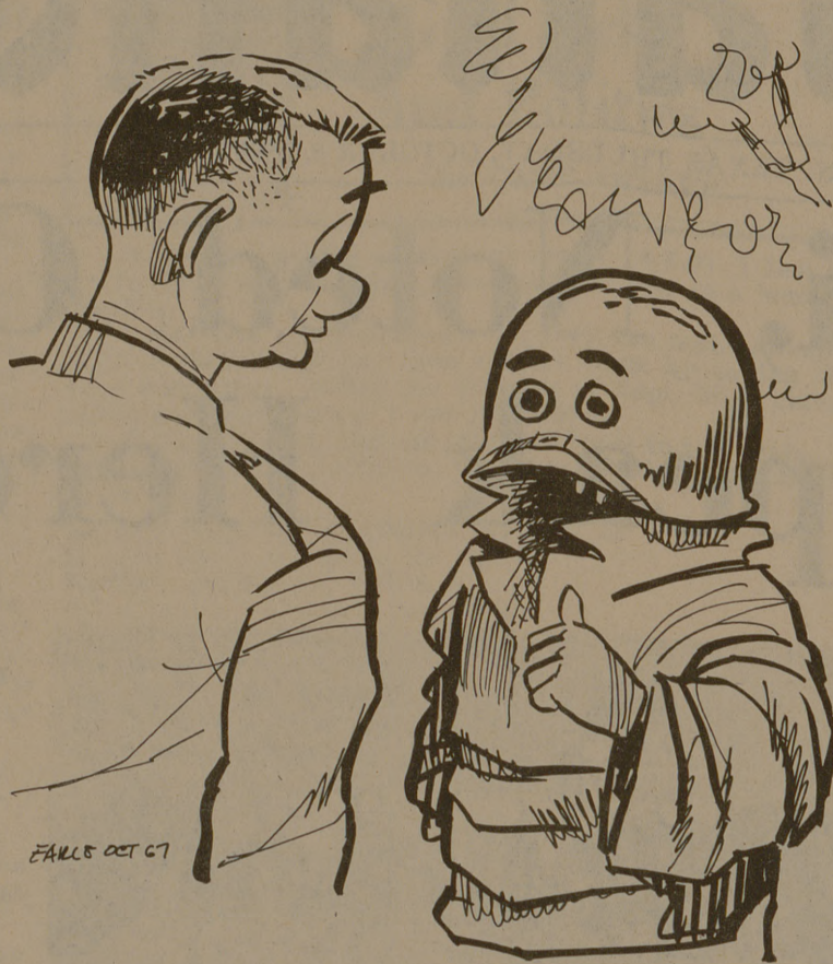
"I got tired of being the man with no face!"

If there was more love in this nation, we could have prevented the summer big-city riots. Love instead of brutality should have been advocated, although I will