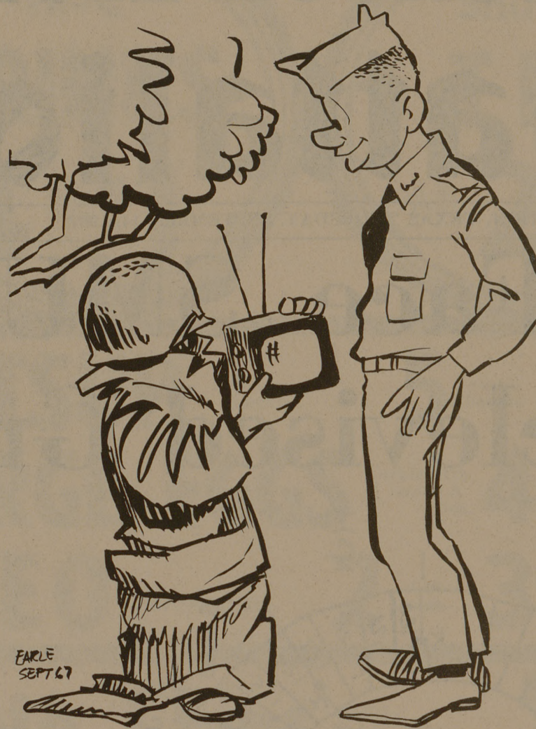
Not only am I going to th' game but I'm gonna see it, too.

Every effort is being made to fill the stadium so that not one single vacant seat can be seen on television. But this is not the best reason to attend the game. This year the Aggies are back and there should be someone there to welcome them.