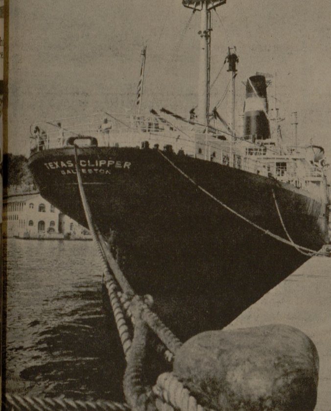
The Texas Clipper Docks in Rio de Janeiro.