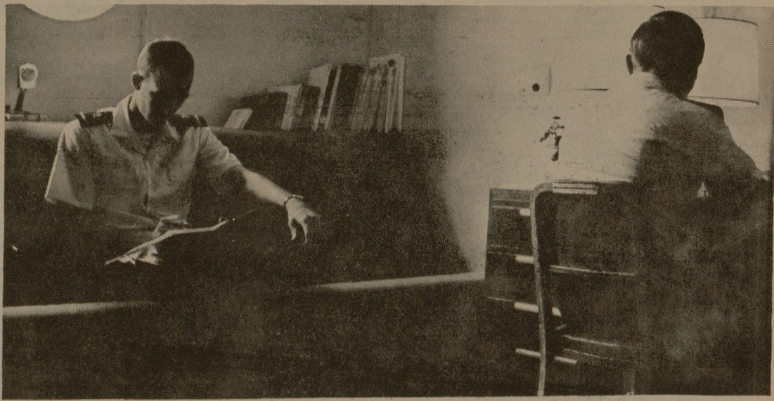
There's Lots of Time for Study Aboard Ship.