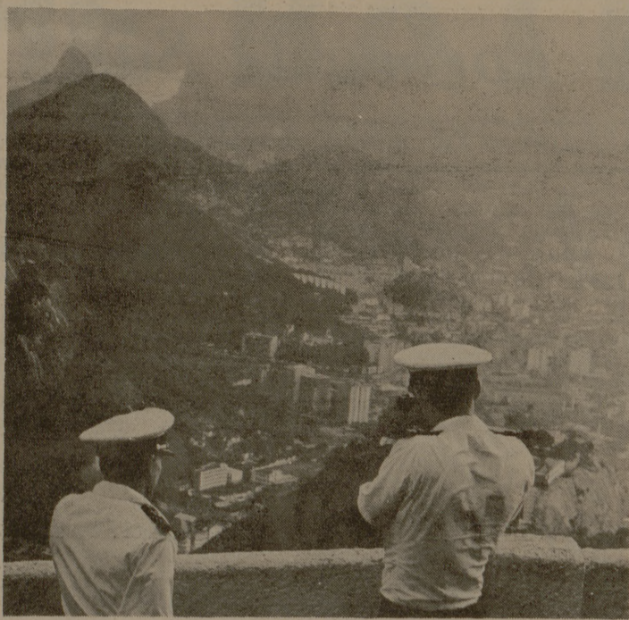
Two Aggies View Rio de Janeiro from Sugarloaf Mountain.

currence among ocean-going vessels. It was not routine, however, for the more than 150 college students who make up the crew of the Clipper, many of them at sea for the first time. The students, mostly from Texas but also from a dozen other states, are enrolled in the "Summer School at Sea" program of Texas A&M. For them, going to the aid of another ship was a highly realistic way of picking up practical experience. The maritime academy cadets are in 4-year programs leading to degrees in marine engineering and transportation. They are putting to test last winter's classroom instruction. This year's cruise, the fifth in the academy's 5-year history, began June 17 when the Clipper left Galveston. It arrived in Rio for a 6-day stay after a stop at Trinidad, and also was scheduled to visit Recife in Northern Brazil and Curacao.