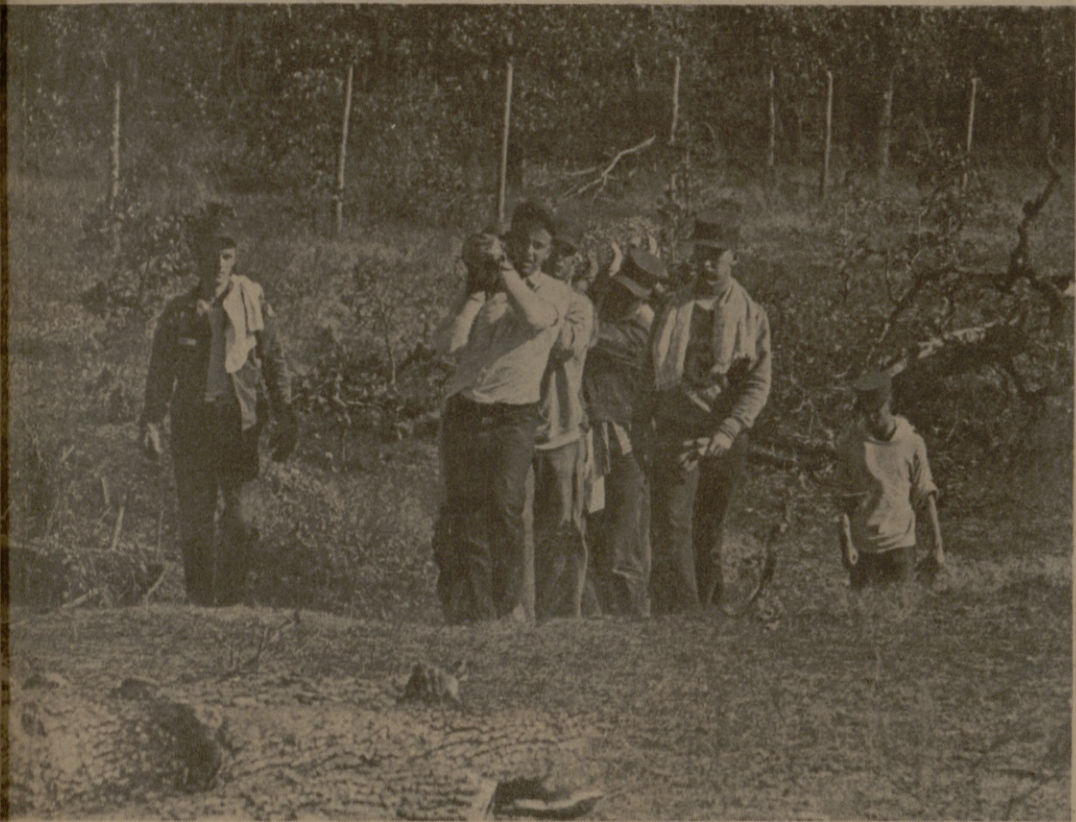
THE CUTTING AREA, SOUTH OF A&M, IS BUSY DURING BONFIRE WEEK.