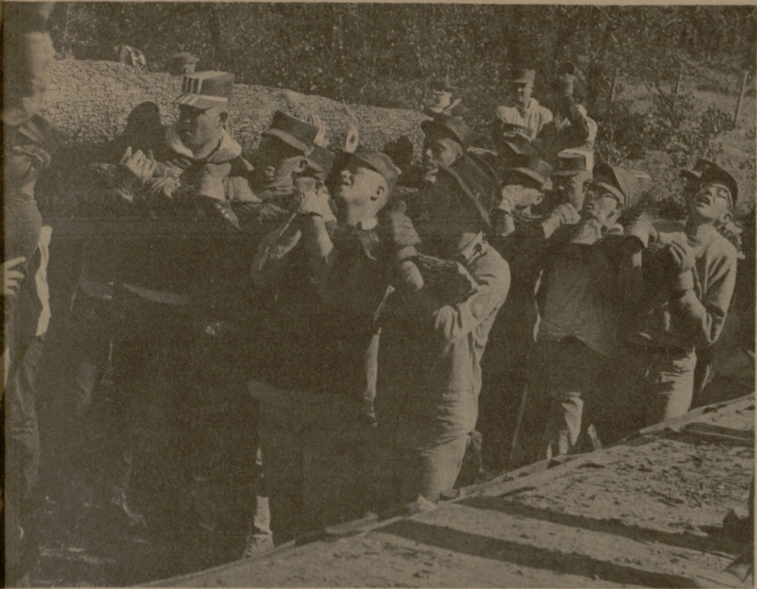
AGGIES HAUL LOGS TO THE STACKING AREA WITH MANPOWER.