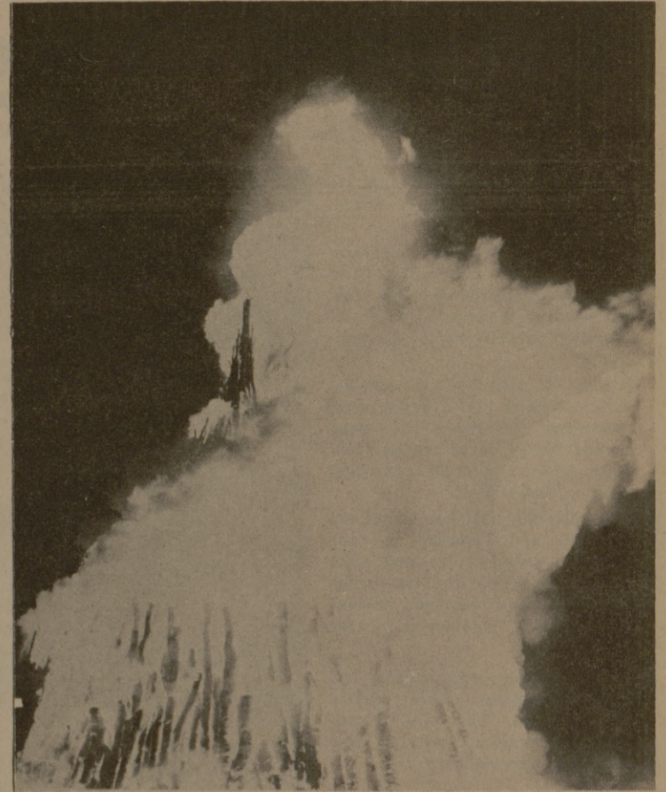
... AND IGNITED AFTER A WEEK'S PREPARATION.