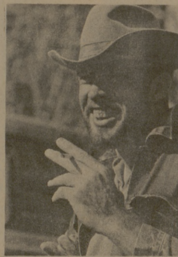
"Hell yeah, We'll beat t. u."