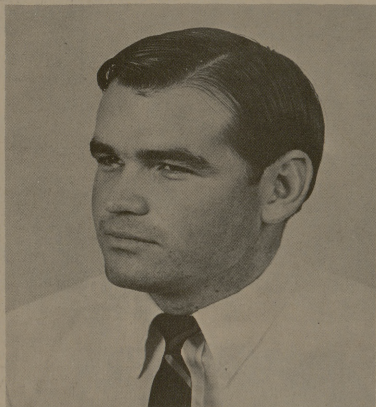
BEFORE . . .