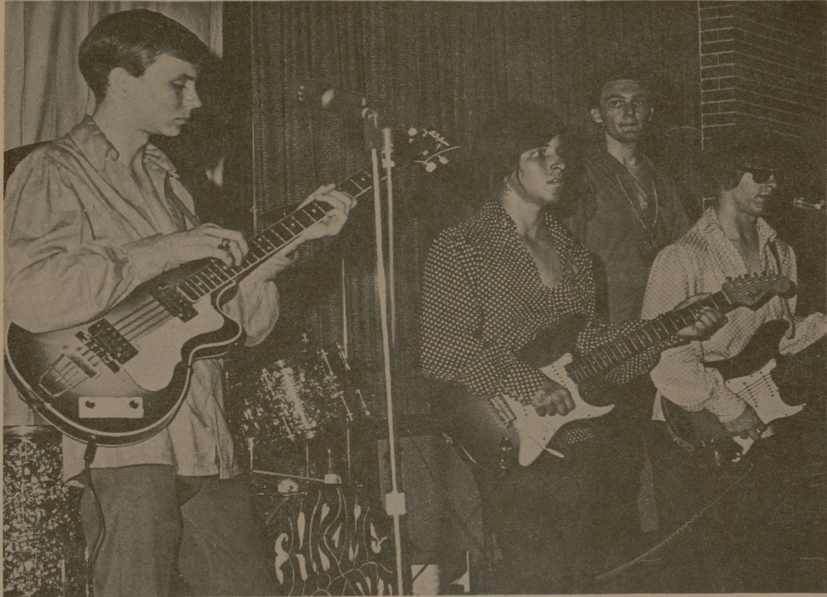
"ELEPHANT" IN ACTION Left, music for the Directorate-sponsored dance was provided by "Chrome Elephant," a group from San Antonio, which used special lighting to give a "psychedelic" effect.