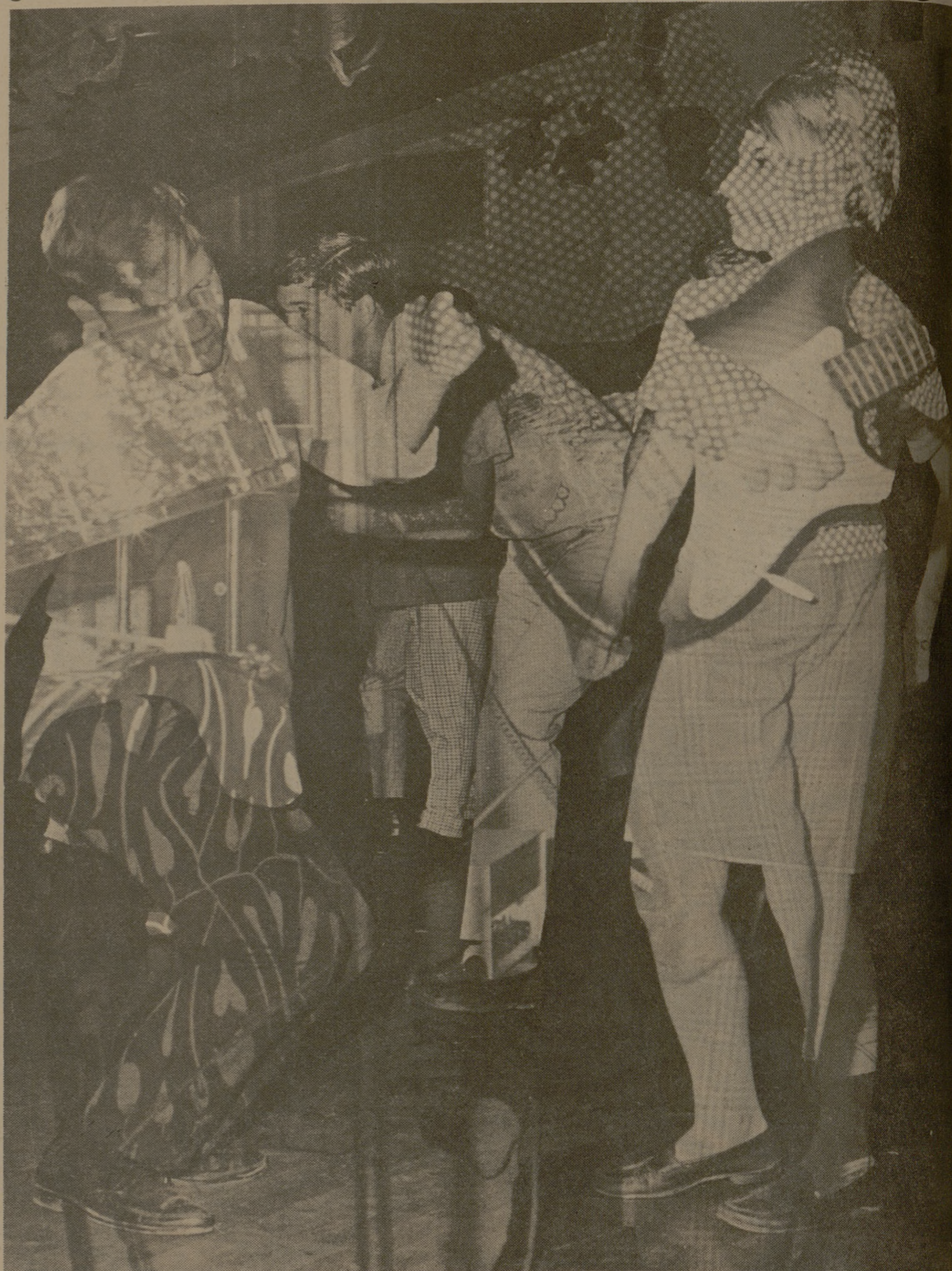
ANOTHER WORLD Right, Psychedelic means "mind expanding." The wild lighting effects and hyper-loud music produced by "Chrome Elephant" was enough to expand anyone's mind—even an Aggie's.