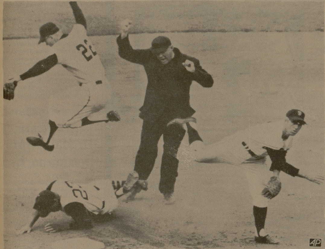
HITHER AND YON