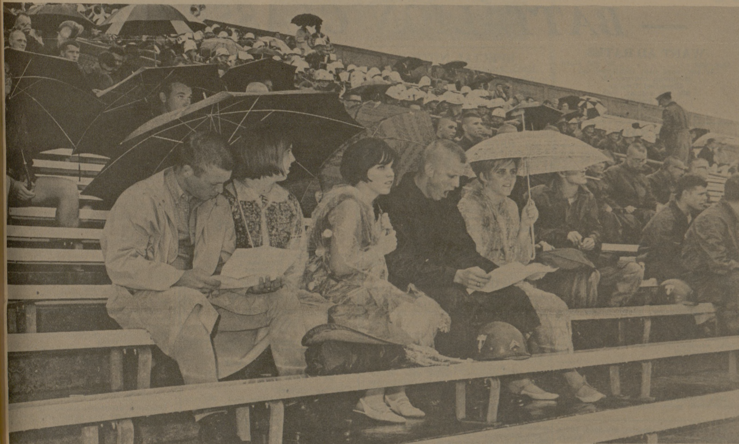
BRAVING THE RAINS Umbrellas and raincoats replaced peanuts and popcorn as monsoon offensive and defensive battle in Kyle Field. standard football - watching equipment during Saturday's