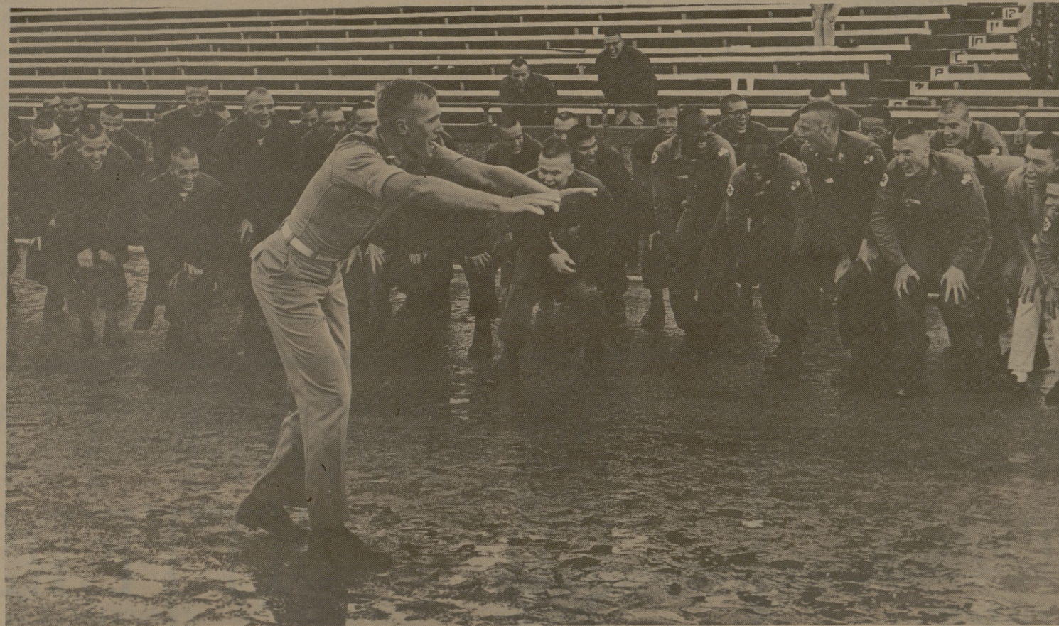
A&M, GIVE ME ROOM!