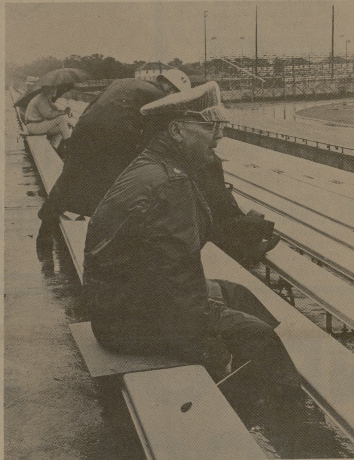
BAND DIRECTOR ON THE SPOT

State Farm Insurance Companies - Home Offices Bloomington, Ill.