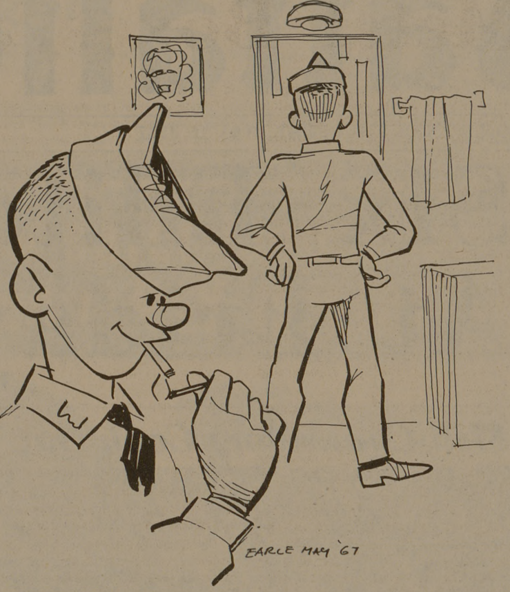
"It'll be a waste of experience for us to be sophomores next week with no freshman in need of our guidance!"

buying and selling books-supplies for generation after