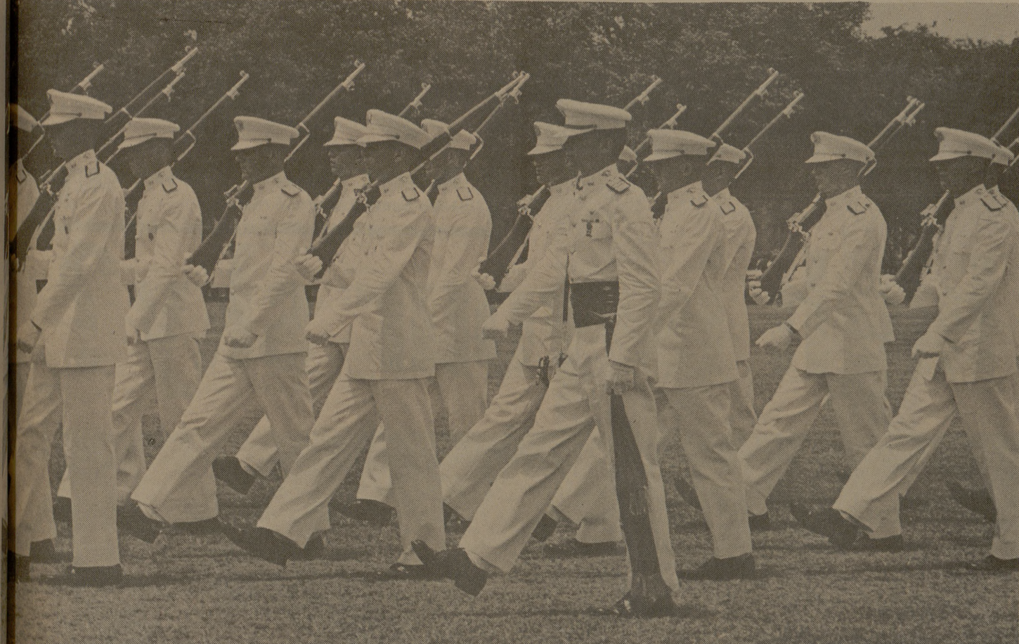
RVS ON PARADE The R.V.S. members, honorary color guard for Gov. John ... were participants in Sunday's Mother's Day parade. The unit performed a special drill during the parade.