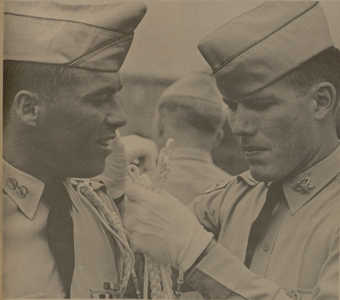
RECEIVES HONOR CHORD