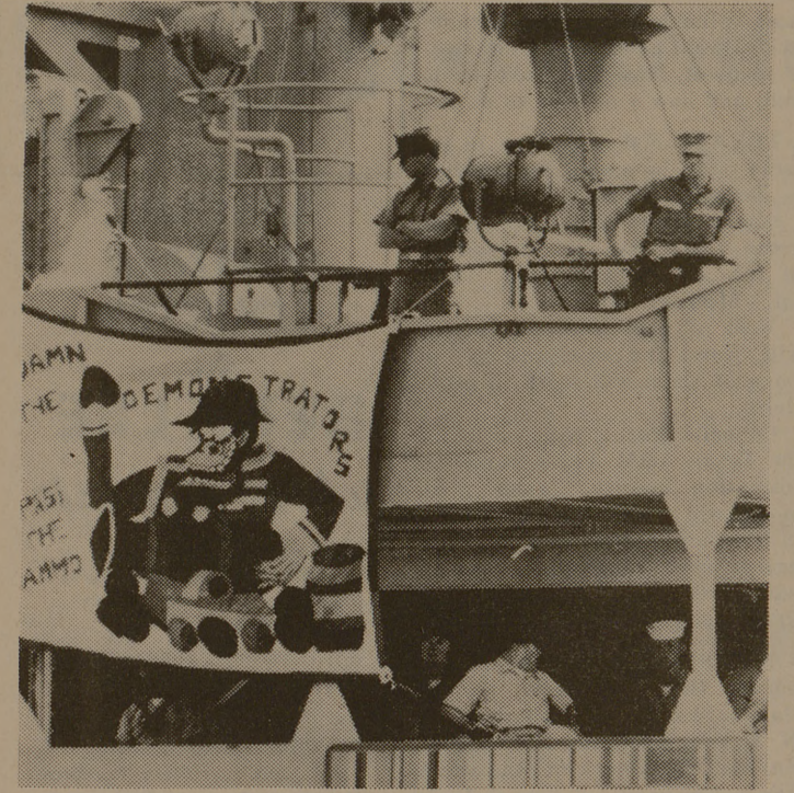
"DAMN THE DEMONSTRATORS"

The 7th Fleet ammunition supply ship Virgo displays a new paraphrase of the old Navy line "Damn the torpedoes—full speed ahead." The Virgo's banner says "Damn the demonstrators" and 'Pass the ammunition," a retort to the antiwar demonstrators in the United States. The ship was photographed cruising 60 miles north of the border between North and South Vietnam.