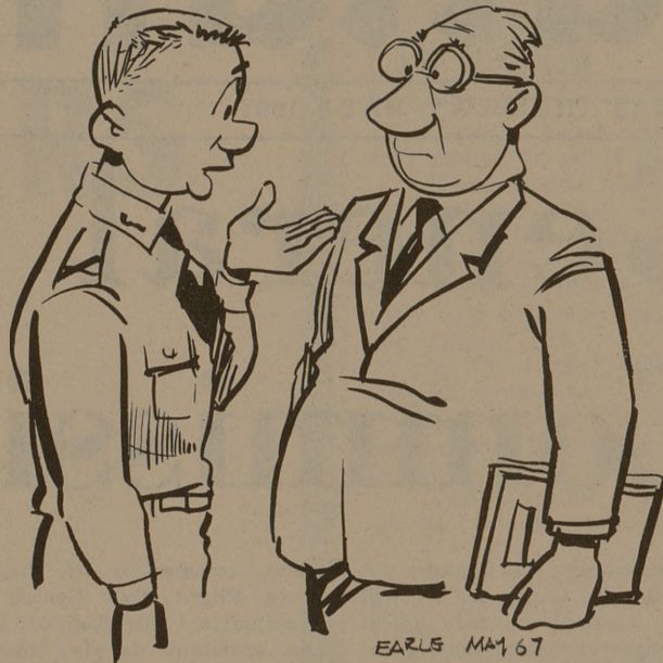
"How much grade credit is a student's overwhelming interest in your excellent course worth?"