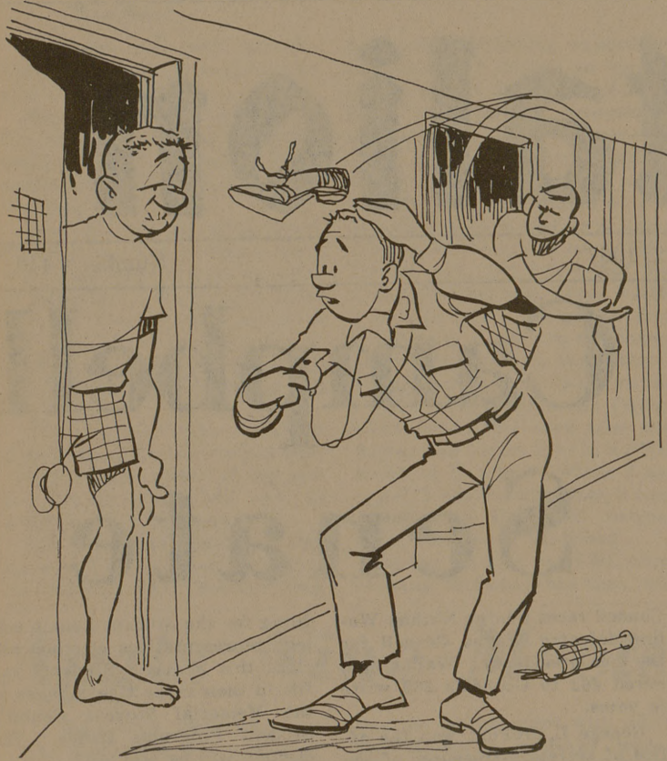
"This Daylight Saving Time is gonna be rough on whistle-jocks for a while!"