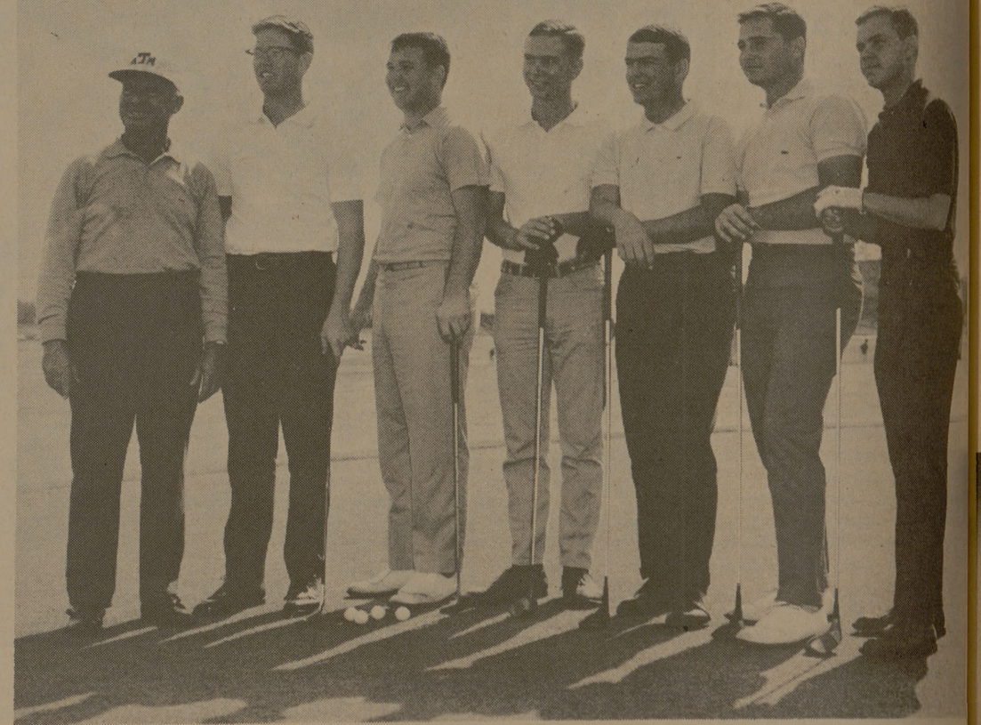
SWC GOLF CHAMPIONS