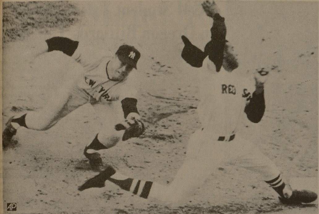
FANCY FOOTWORK BY MANTLE

Mickey Mantle, now a first baseman for the Yankees, dives to get Reggie Smith, Boston Red Sox, after fielding bunt at Boston, Mass. New York won, 7-5.