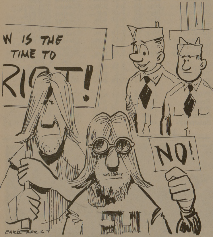
"Would you believe that this is where the 'Aggie Joke' was originated?"