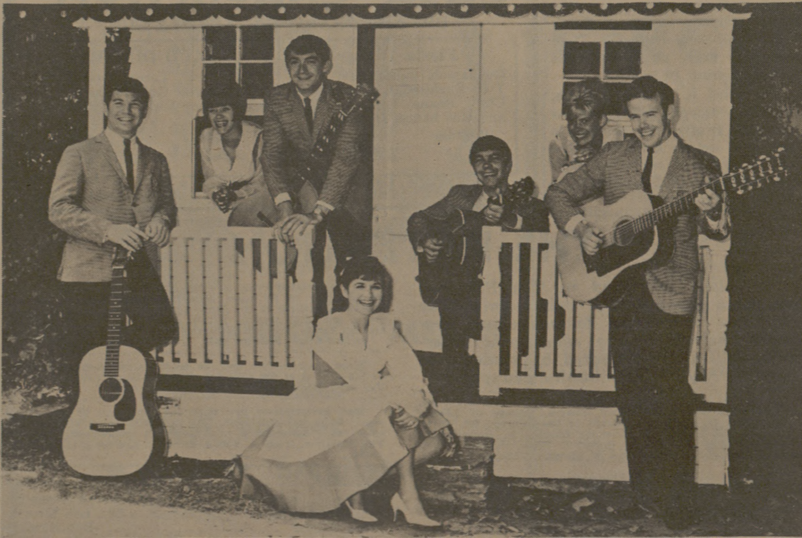
TOWN HALL EXTRA The Back Porch Majority and Skeeter Davis as they appear at G. Rollie White Coliseum. will highlight Civilian Weekend activities