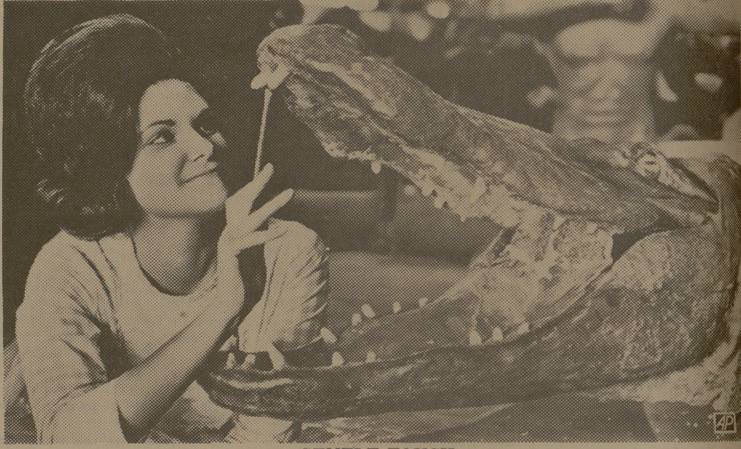
GENTLE TOUCH Last year the popular tourist attraction staff applies some white paint to the teeth of this life-like alligator. The amusement park is set to open its season on April 29.