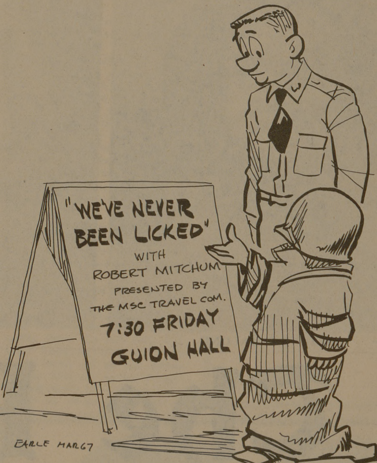
"I thought it was a tremendous movie! Who said Mitchum was tryin' to buy it?"