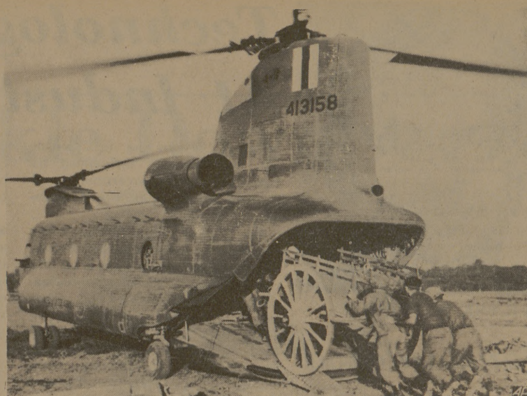
HELICOPTER SWALLOWS OX CART A South Vietnamese ox cart is loaded in the hold of a U. S. Army Chinook helicopter near the village of Ben Suc located in the Iron Triangle about 30 miles northwest of Saigon.