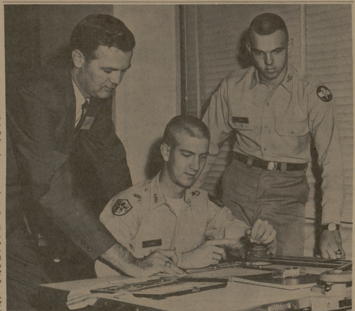
PRO ENGINEERING AID