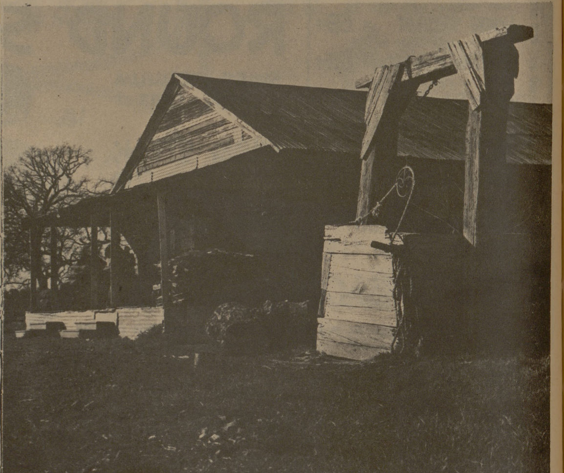
NO RUNNING WATER The Roarks depend on this well for their water supply. In the background is picture of the esque old store with firewood stacked on the porch.