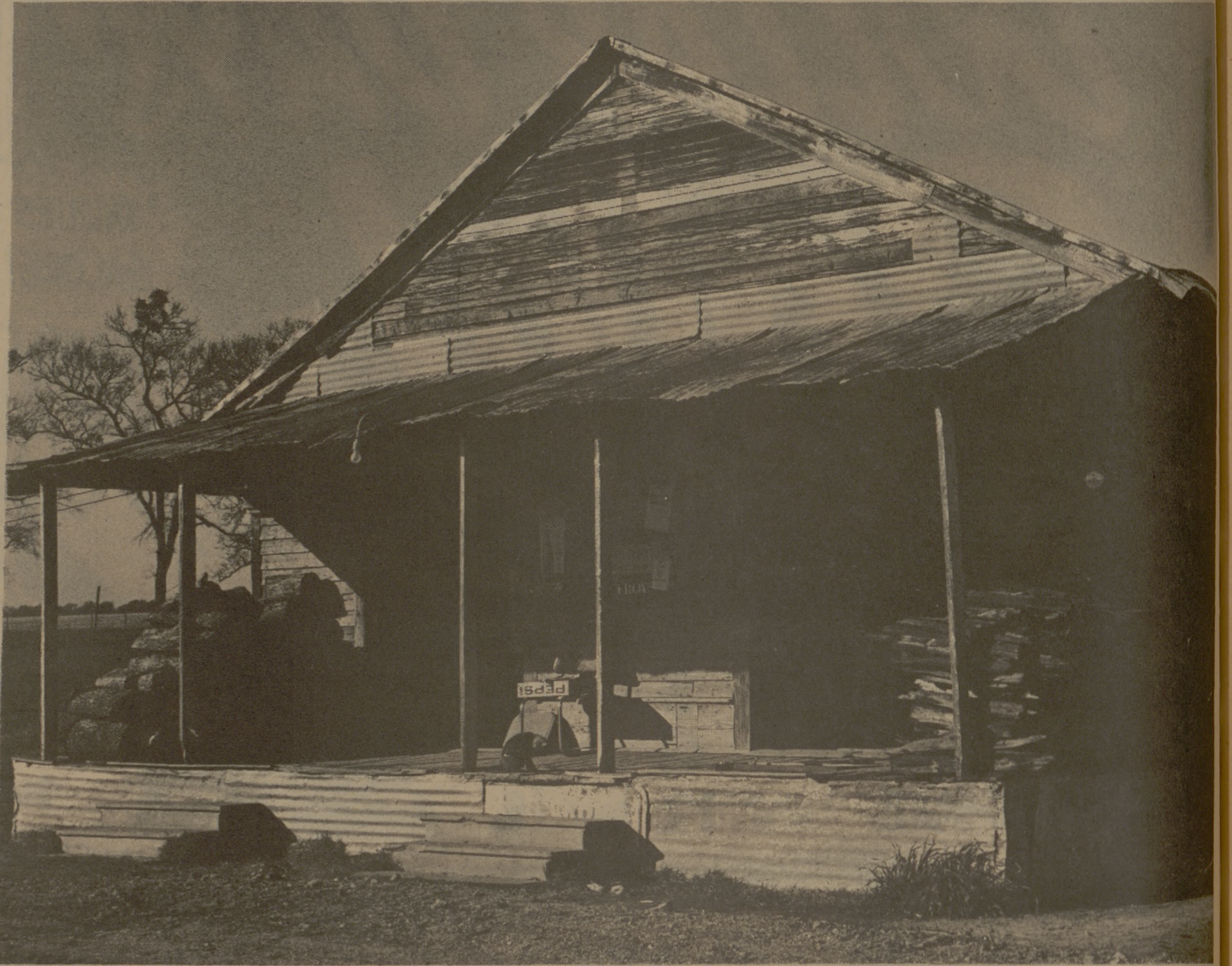
THE TOWN OF CAWTHON This old general store owned by Carroll and Russell is all that remains of the town that was once Cawthon, Texas. The railroad that was pulled out last year. The Roarks still use an old wood burning stove for cooking and heat.