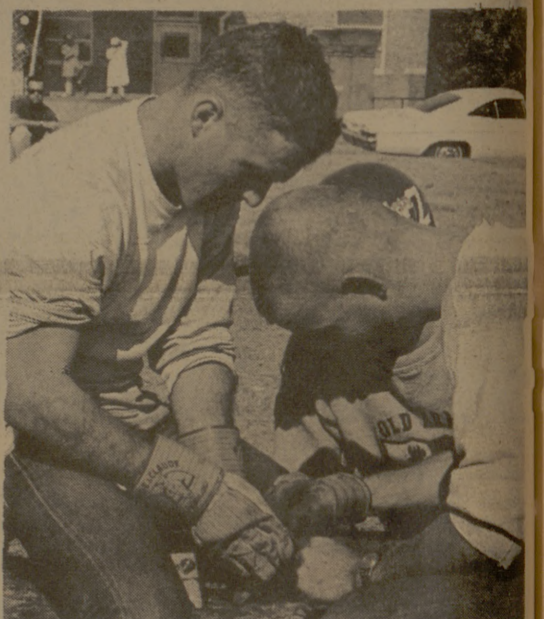
These things always pick the most inopportune times to come loose.