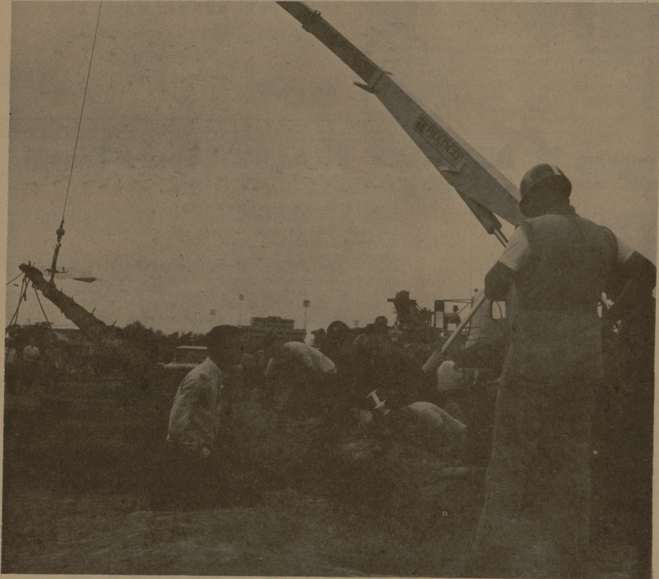
"There's always one guy in the crowd who's got ta sit down and tell ya how it oughta be done . . ."