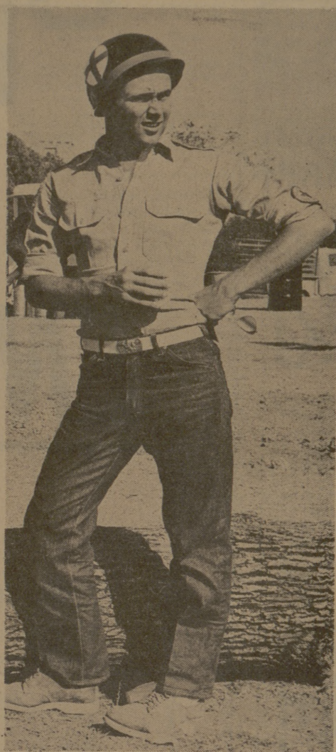
"Suck it up, fish!" (Above)