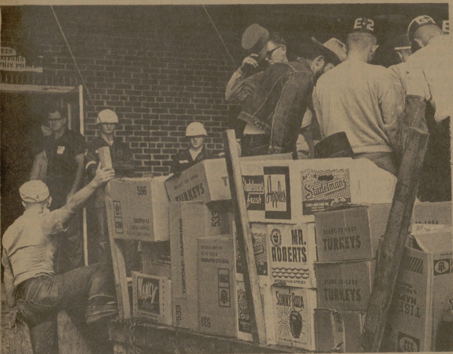
Good ol' Bonfire chow for the troops out in the woods.