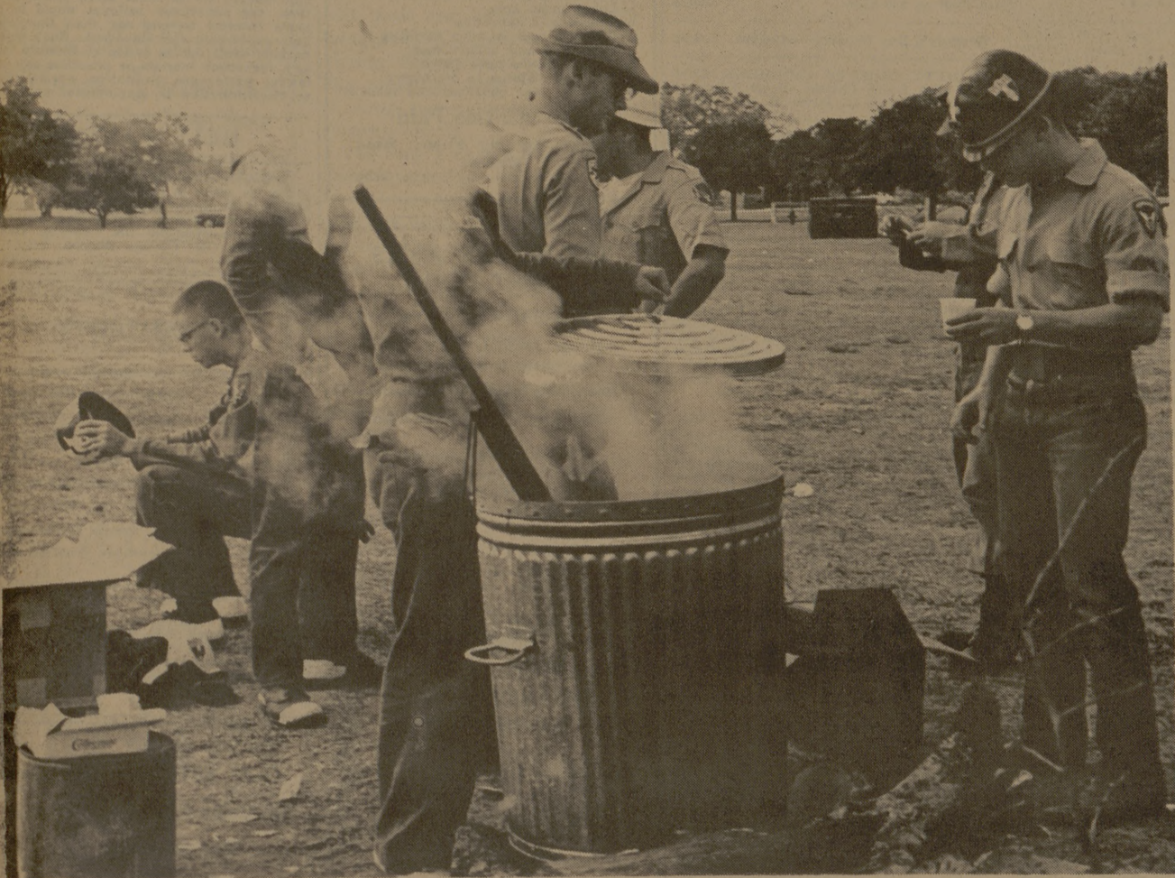
"I'll never complain about my ol' lady's dope again! This stuff'd float a nail!"