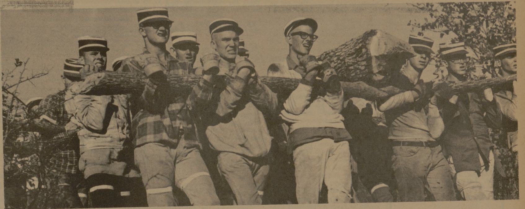
"I love a pa - rade . . ."