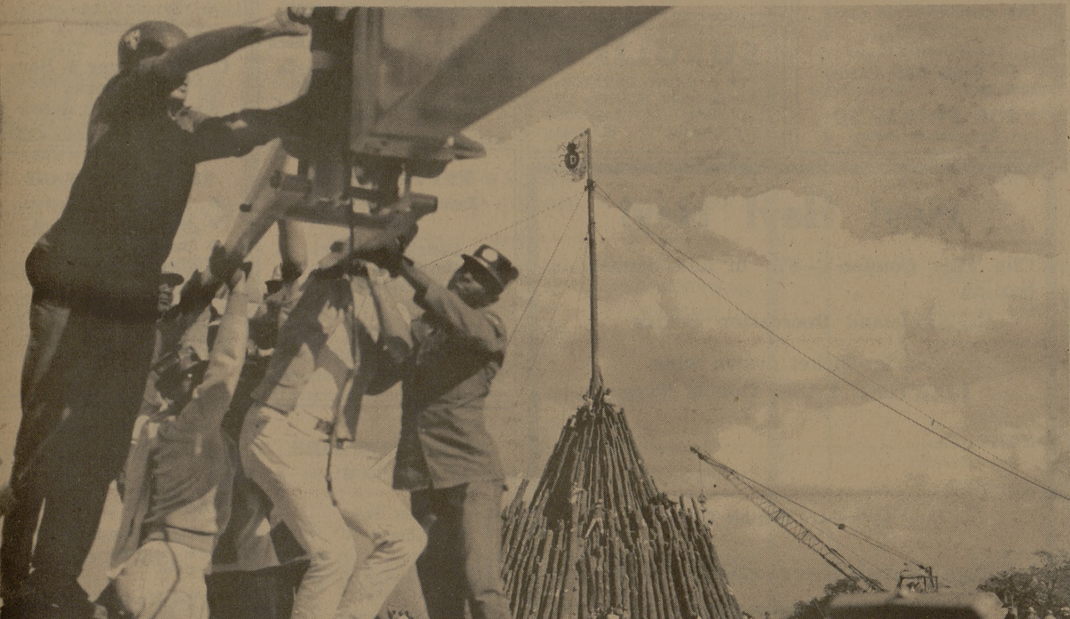
'If somebody had told me I'd be doin' this two years ago I'd 'a told 'em they were crazy