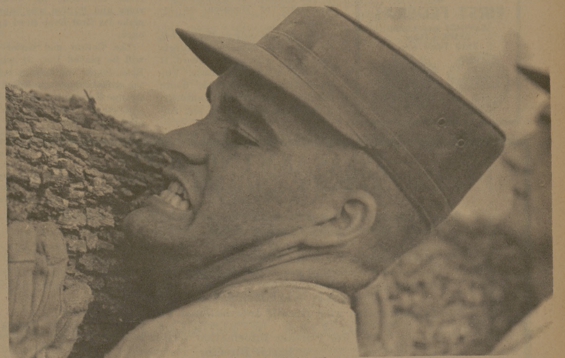
"There's really nothin' to it. You just lift it like this and . . . uuughhhhhh!"