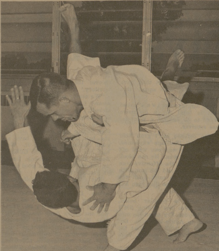
Aggie Judo Club members practice for clinic to be held here next month.