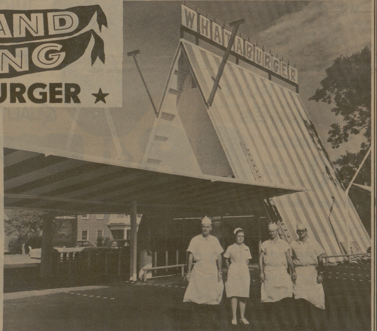
WHATABURGER 1101 S. COLLEGE AVENUE ACROSS FROM WEINGARTEN'S

made with garden-fresh vegetables and pure beef a whole 1/4 pound