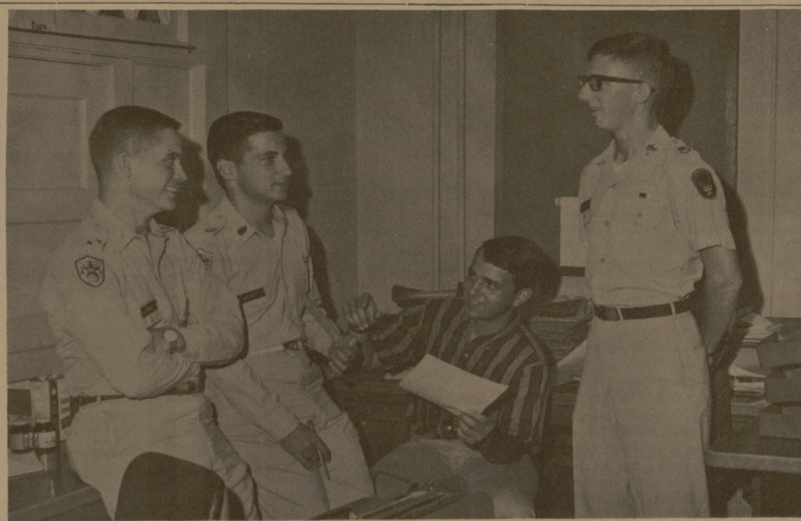
NEW BATT MEN

A preliminary report will be made to the USBPR later this month. Another report will be made before bureau officials report to Congress in January.