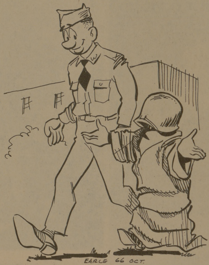
"All it takes is patience! Last week we had a losing streak goin' and now we're tied for the championship!"

September visitors to Texas A&M University totaled the lowest for the year.