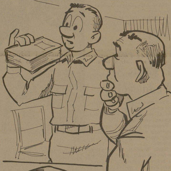
"Remember that snap course you suggested? This is one week's notes!"

But regardless of the reason for the mishap, Reveille I deserves an accurate replacement.