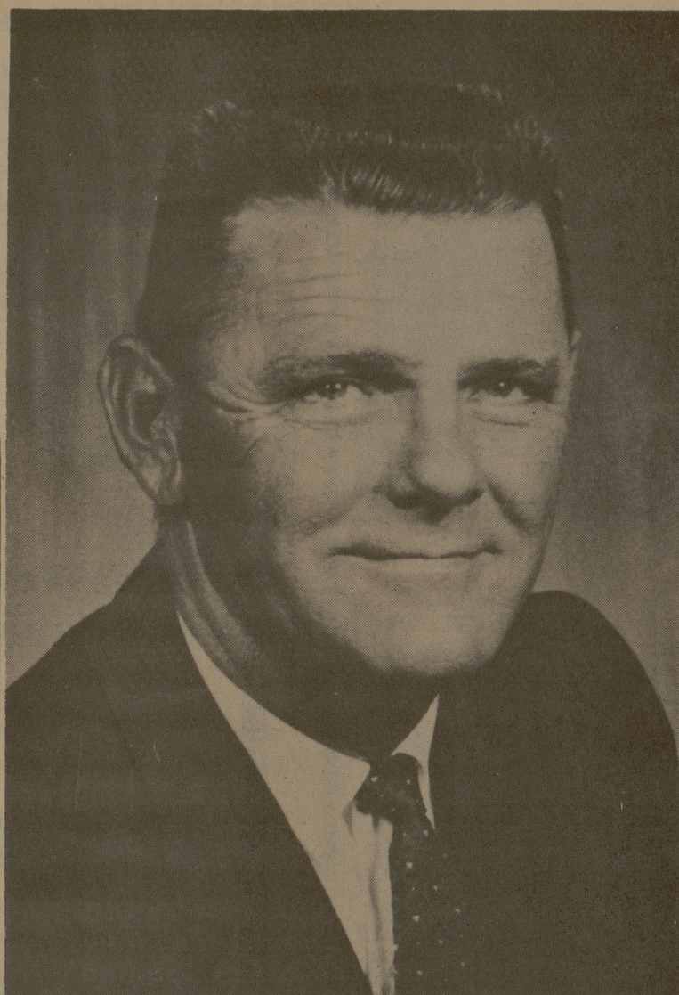
A&M'S FISH COACH