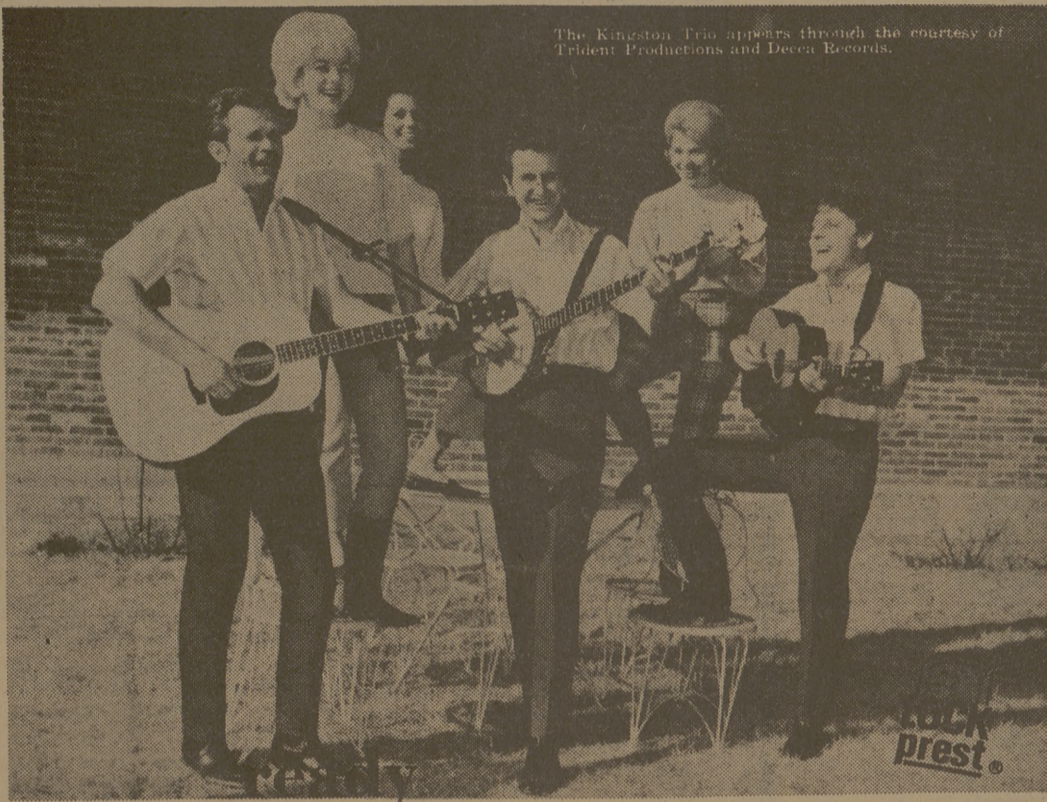
The Kingston Trio appears through the courtesy of Trident Productions and Decca Records.