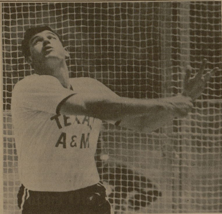
ANOTHER RECORD FOR MATSON Randy Matson follows through after hurling the discus for a new NCAA record in Bloomington, Ind., Saturday. After setting an NCAA record in the shot put Friday, the Texas A&M strongboy threw the discus 197 feet.