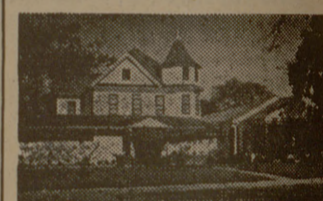
Hillier Funeral Home

BRYAN, TEXAS 502 West 26th St. PHONE TA 2-1522